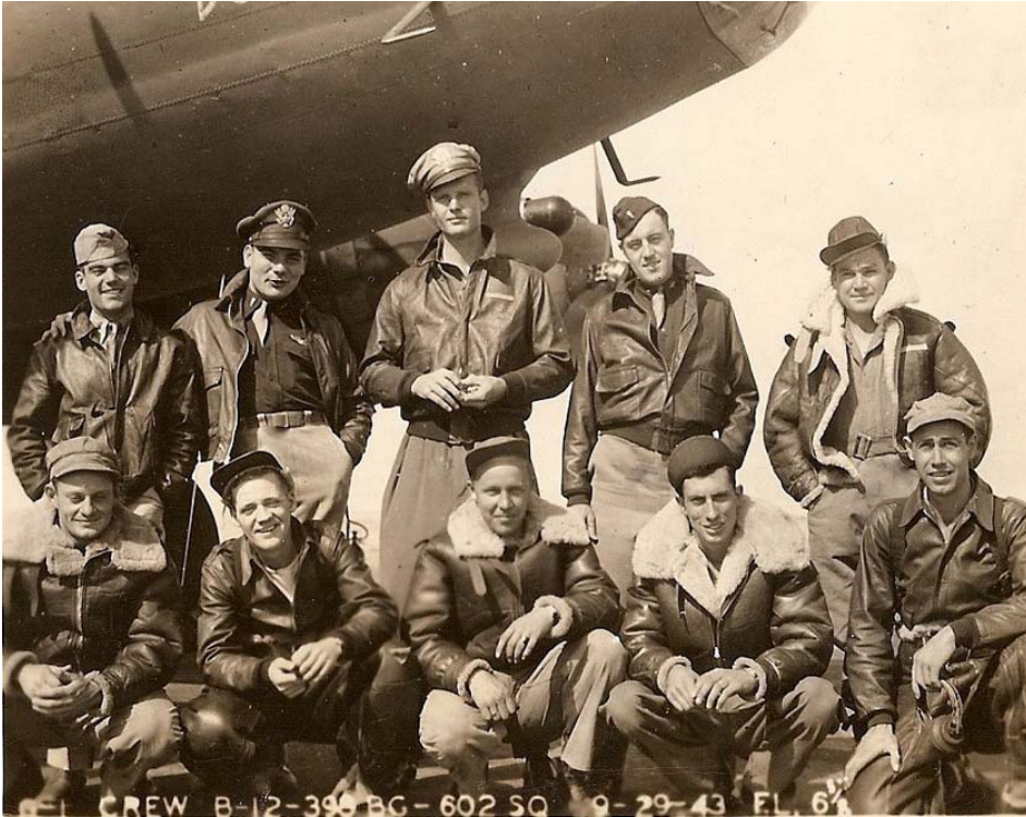
Unknown crew 602 nd SQ.

This training photo is dated September 29, 1943.