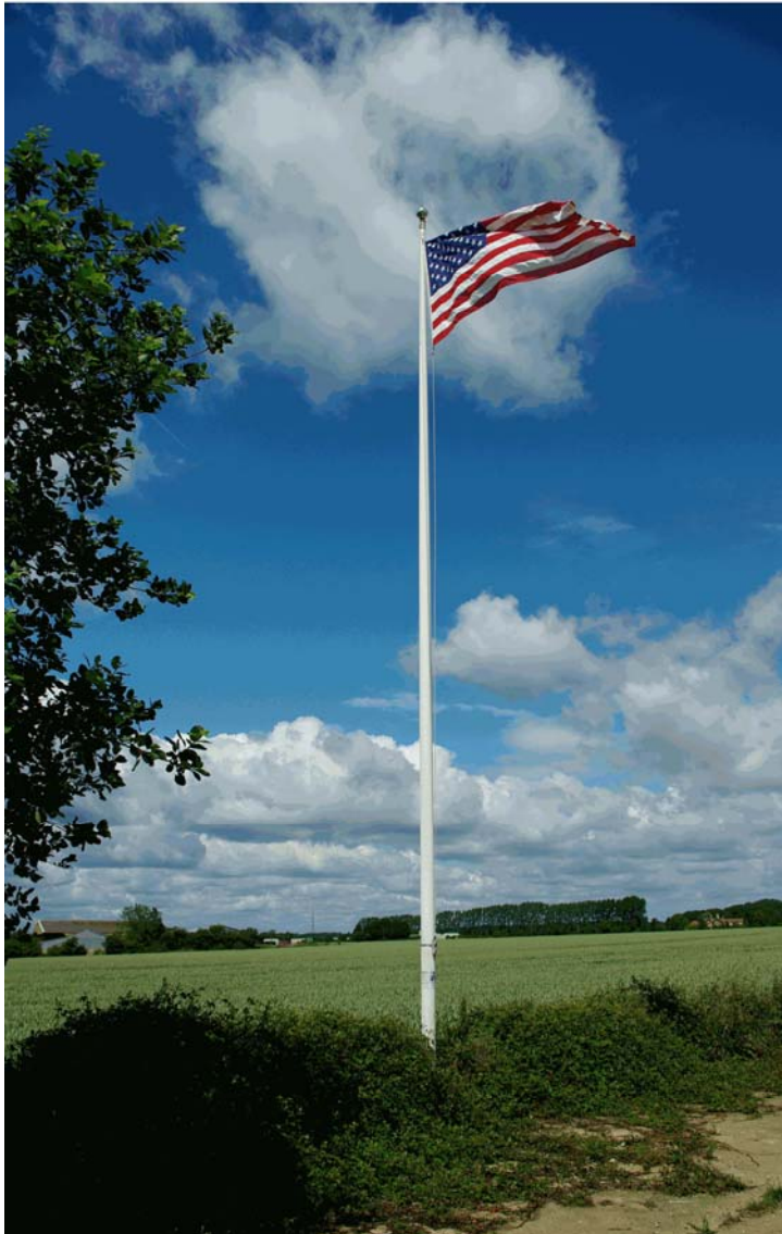
Ralph McIntyre's flag flew over Station 131 on Father's Day, 2011