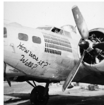
600 th SQ B-17 42-9729 N8 P "How Was It? Well?"