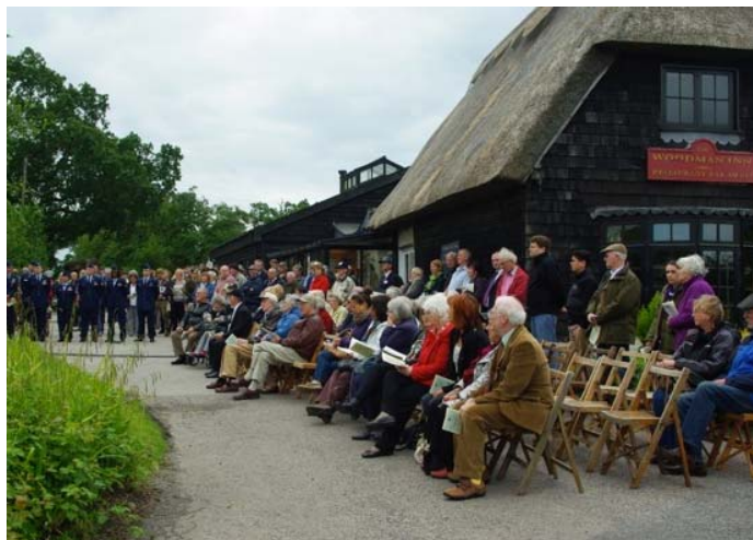
Veteran's families, members of the local community and personnel from the 95 th Reconnaissance SQ RAF Mildenhall and the United States Air Force gather for the Memorial Day service honoring the 398 th BG & 55 FG.

We are truly blessed with a local community who are so willing to do whatever they can to show their respect and admiration for the young Americans that travelled here during wartime and stood alongside our English and Commonwealth servicemen, to fight the threat of Nazi Germany tyranny.